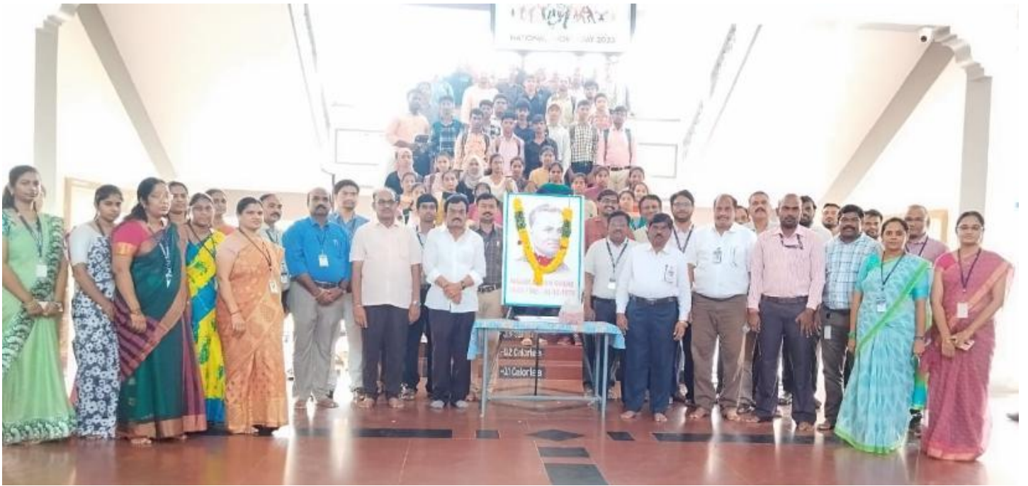
Group Photo of Annamacharya University Deans, Heads of Departments, Teaching Faculty, and Students