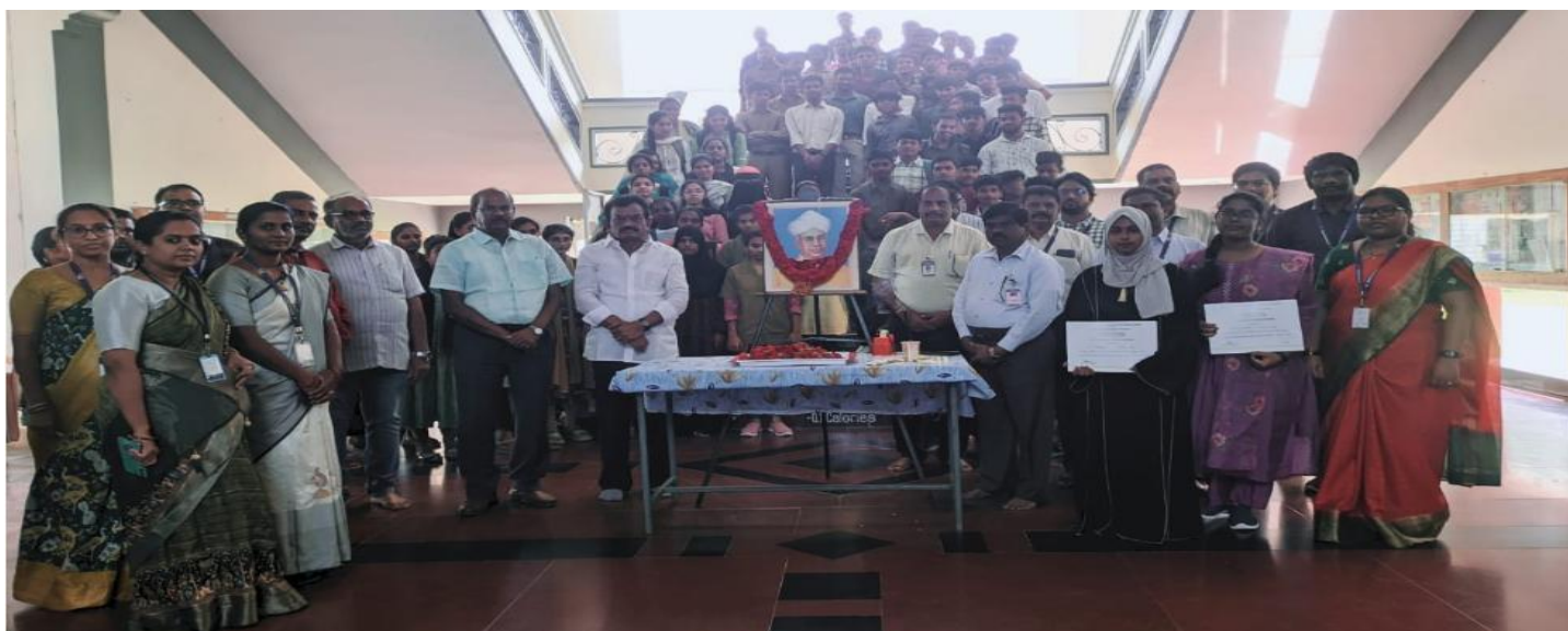
Group Photo of Annamacharya University Vice-Chancellor, Vice-Chairmen, Deans, Heads of Departments, Teaching Faculty, and Students.